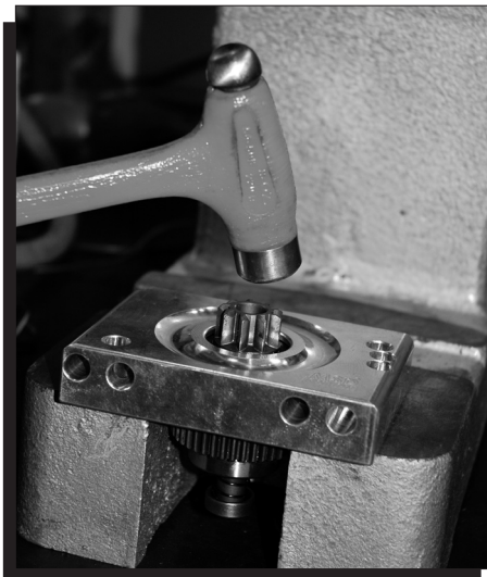
Figure 1 Removing the Pinion Assembly.